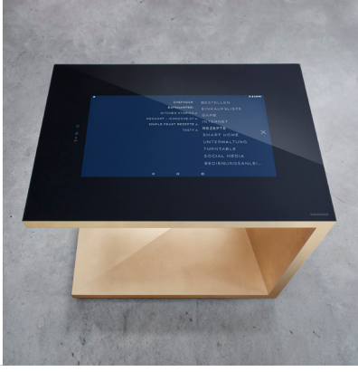
M.Pod Table: 32-inch touchpad made of especially hardened and optically bonded safety glass.