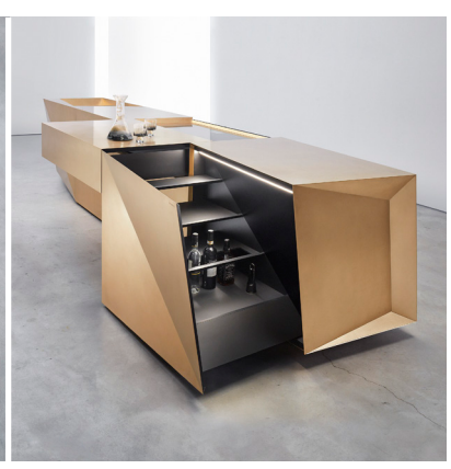
Pull-out cooktop and bar element open.

"Traditionally, the golden shimmering tombac was used to make jewellery and watches. Due to the high copper content, the brass has a very beautiful and warm appearance. It looks a bit like gold."