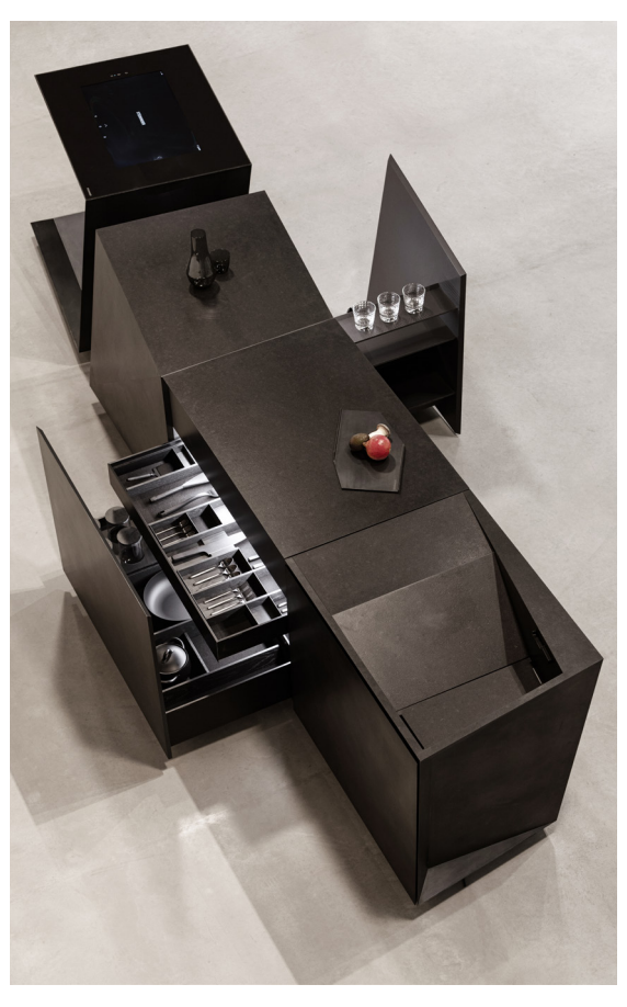
FOLD BLACK with M.POD.

However, these luxury models are made to measure at the customer's request - i.e. with millimetre precision. Models in the ,standard sizes' mentioned can be seen at the headquarters and in selected STEININGER monobrand stores."